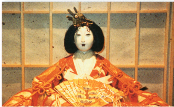
Figure 1: Hina-ningyo: Doll for the Girls' Festival.

According to Hara, black teeth were an esthetic symbol from ancient times. 1, p.190 In the Heian Era (794-1192), ohaguro became popular among males, especially court nobles and commanders. 1, p.131 Among samurais, the custom of ohaguro was a proof of loyalty, indicating that a samurai does not serve two masters within a life-