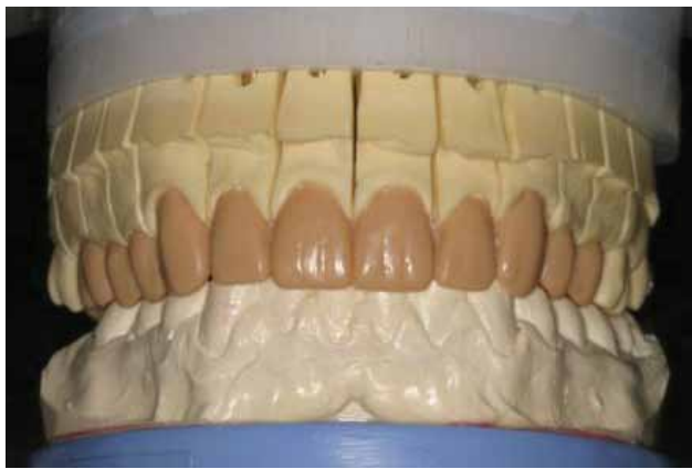
Figure 5: Master die model wax-up with soft tissue features in place.