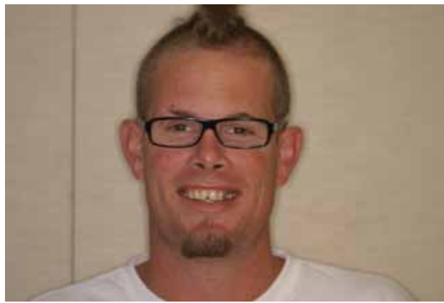
Figure 1: Preoperative portrait.