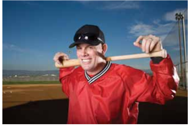
Figure 23: Glamour shot.

middle lobes and then fired to set the stain. Effects powders Pearl and Orange Fluorescence (Authentic) were placed over the core lobe details and then fired (Figs 13 & 14). After firing and evaluating the effects, the mesial and distal troughs were filled with Opal 3 and Opal 2 (Authentic) was placed between the lobes, which contrasted well with the effects. After firing, the contrasting Opals were evaluated and then the restorations were brought to full contour using Opal 2, while being careful to place back only what was removed in the cutback (Figs 15 & 16).