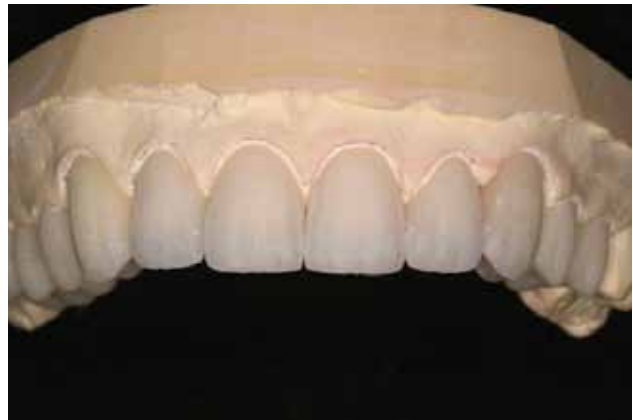
Figure 18: Ready for glazing.