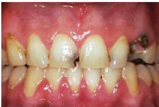
Figure 20: Preoperative view.