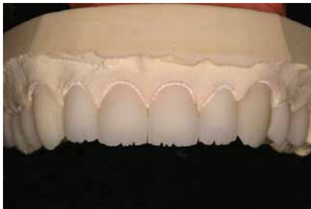
Figure 12: Mammelon structures.