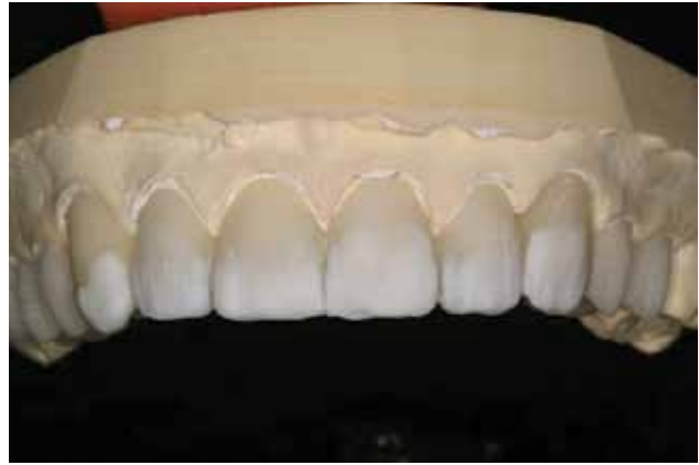
Figure 16: Layered to contour.