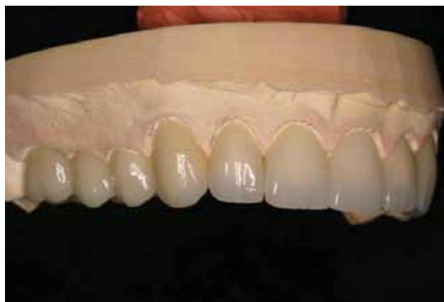
Figure 19: Final glaze and polish.