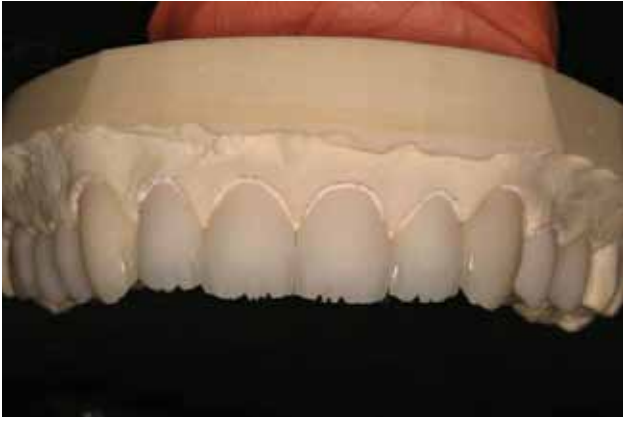
Figure 13: Internal staining.