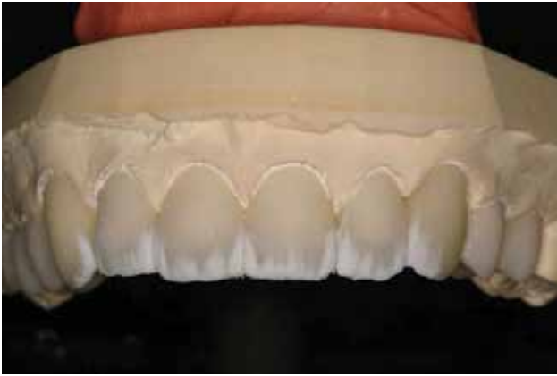
Figure 15: Contrasting opals.