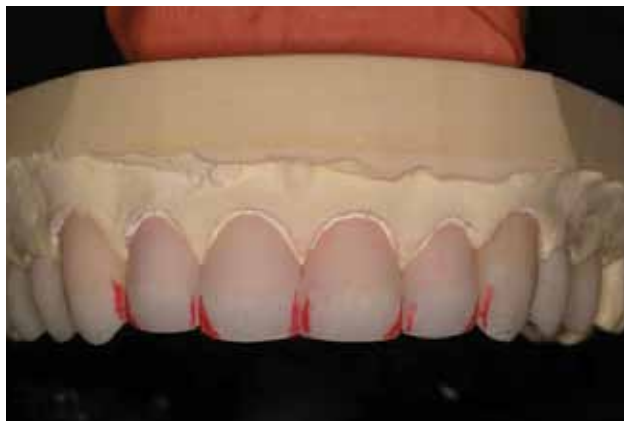
Figure 10: Mesial and distal troughs.