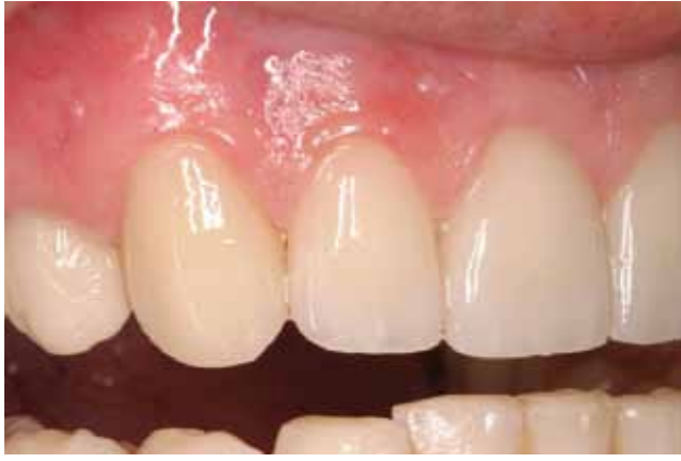
Figure 22: Postoperative view.