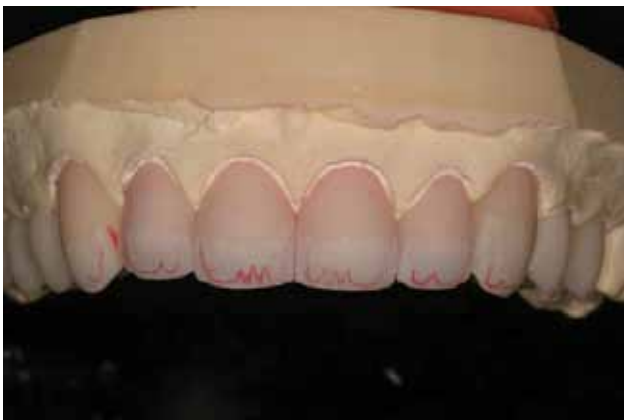
Figure 11: Mammelon structures.