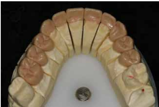
Figure 7: Occlusal view of wax-up.