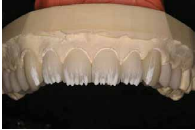
Figure 14: Internal effects powders.