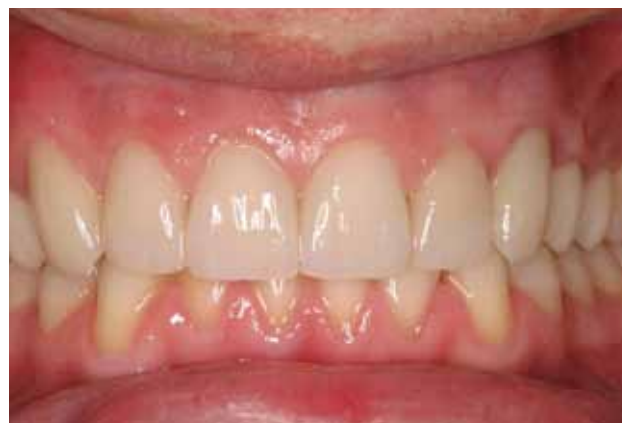
Figure 21: Postoperative view.

sion and esthetics were perfected (Figs 6 & 7).