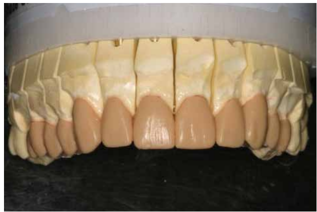
Figure 6: Master die model with dies trimmed.