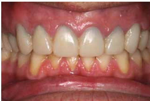
Figure 2: Provisionals.