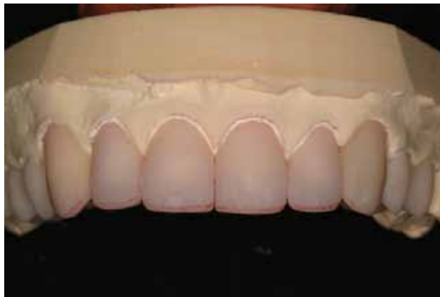
Figure 8: Vertical reduction.