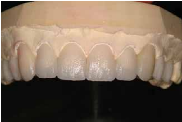
Figure 17: Ready for final contouring.