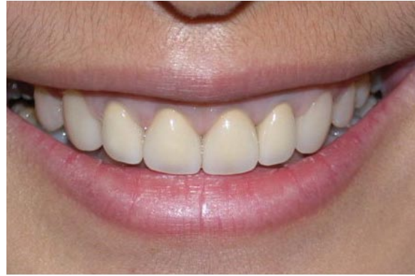
Figure 2: Postoperative smile after an esthetic crown lengthening and restorative treatment.

Dentistry, University of Southern California (USC) School of Dentistry.