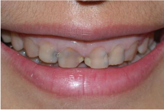
Figure 1: Preoperative smile showing delayed eruption, caries, and tetracycline discoloration.