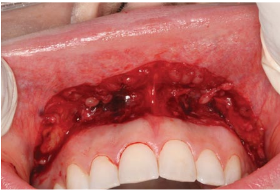
Figure 11: Exposed submucosa after removal of the epithelial discard.