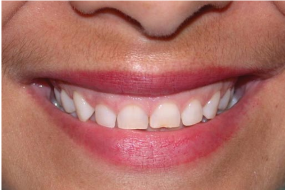
Figure 3: Excessive gingival display due to attrition and compensatory eruption.