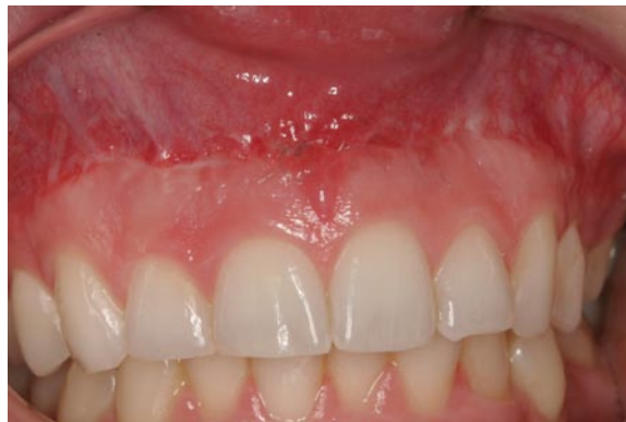
Figure 15: Postoperative retracted view showing scar formation.

along the mucogingival junction. A second parallel incision is made at the labial mucosa at approximately 10-12 mm distance from the first incision. The two incisions are connected at the mesial line angles of the right maxillary first molar and the left maxillary first molar to create an elliptical outline (Fig 10). In the authors' experience, the amount of tissue excision should be double the amount of gingival display that needs to be reduced, with a maximum of 10-12 mm of tissue excision. The epithelium is removed in the incision outline, leaving the underlying submucosa exposed (Fig 11). Bleeding can be controlled by an additional local anesthesia infiltration and the use of electrocoagulation. The two incision lines are approximated with Maxon 6/0 stabilization sutures (United States Surgical, Tyco Healthcare Group; Norwalk, CT) (Fig 12). Care should be taken regarding proper alignment of the midline of the first and second incision lines (lip midline and teeth midline). Once the flaps are stabilized, an additional continuing interlocking suture is used to secure complete closure. Pressure is applied until hemostasis is achieved (Fig 13).