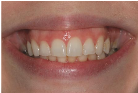
Figure 7: Preoperative smile with excessive gingival display.