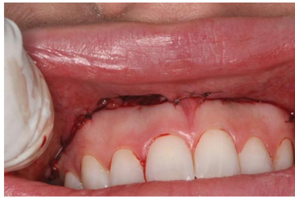
Figure 12: Stabilization sutures in place.