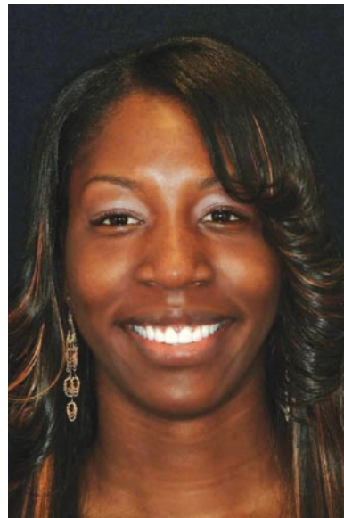
Figure 17: Postoperative smile after a lip repositioning procedure and an esthetic crown lengthening.

Cosmetic dentistry by Dr. William Dorfman.