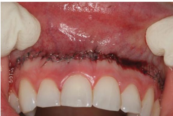
Figure 13: Continuous interlocking suturing.