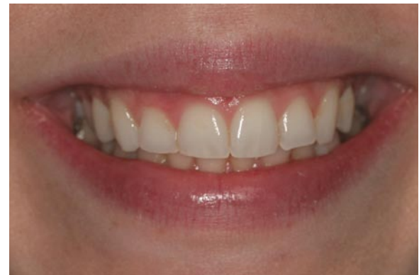
Figure 8: Postoperative smile after three months.