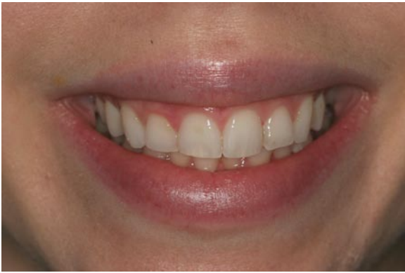
Figure 9: Postoperative smile after one year, displaying stable results.