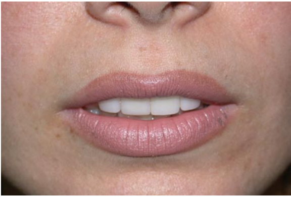
Figure 5: Rest position of a patient with vertical maxillary excess demonstrating "incompetent" lips. Dentistry, University of Southern California (USC) School of Dentistry.