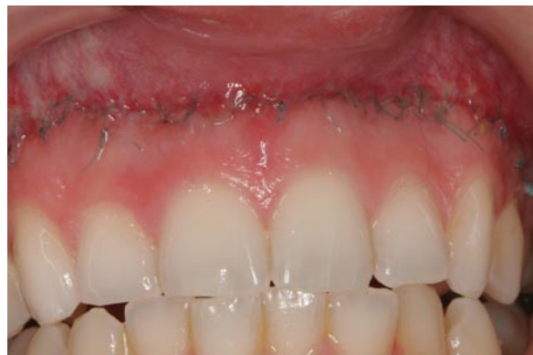
Figure 14: Postoperative retracted view after one week.