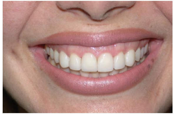
Figure 6: Smile view of a patient with vertical maxillary excess. Dentistry, University of Southern California (USC) School of Dentistry.