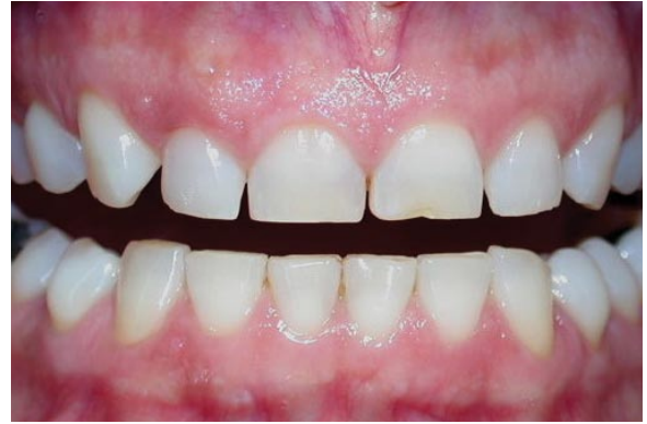
Figure 4: Retracted view, demonstrating signs of attrition and compensatory eruption.