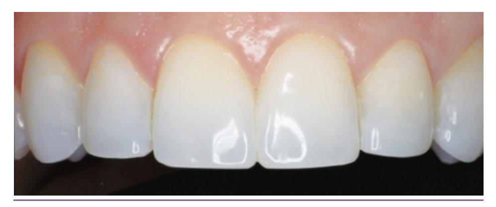
Figure 2: After, 1:1 view, cropped to better show details of case.