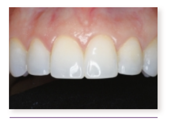
Figure 6: 1:1 retracted frontal view, post-treatment.