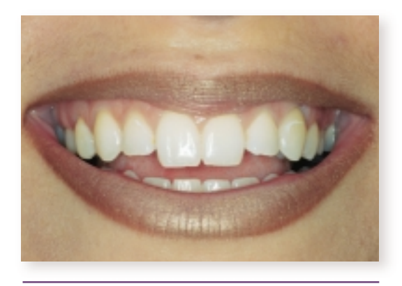
Figure 1: 1:2 full-smile frontal view, pretreatment.

The patient was a 27-year-old female. She was in excellent health and had seen a dentist regularly since childhood. She presented with maxillary anterior teeth that she characterized as "short and yellow"; in particular, she did not like her lateral incisors, which she felt were short (Fig 1). The patient had received orthodontic treatment as a teenager but, due to the unfortunate shortness of the laterals' roots, they were prevented from being extruded adequately. She wanted a more uniform, full, and whiter smile (Fig 2).