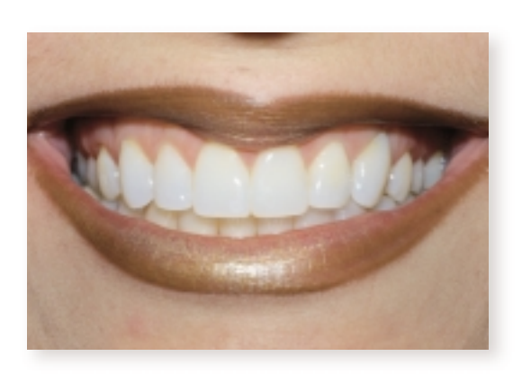
Figure 7: 1:2 full-smile frontal view, post-treatment.