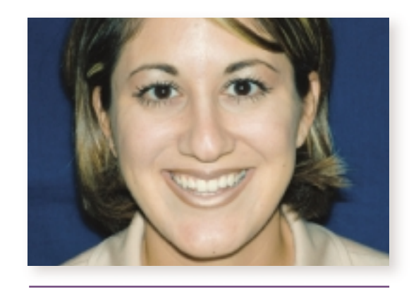
Figure 2: 1:10 face, pretreatment.