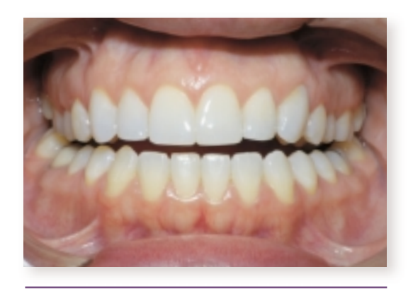
Figure 5: 1:2 retracted frontal view, post-treatment.