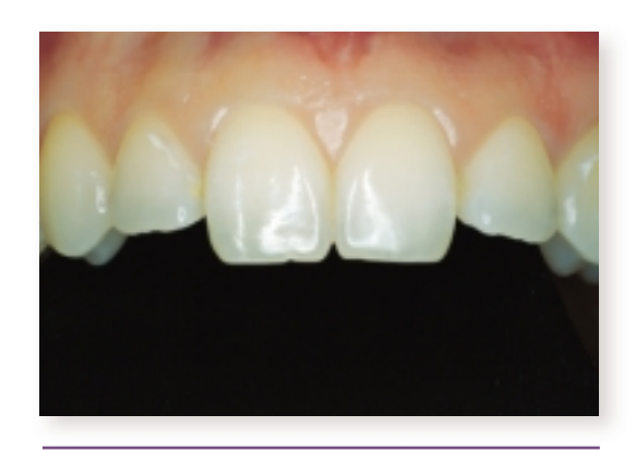
Figure 4: 1:1 retracted frontal view, pretreatment.