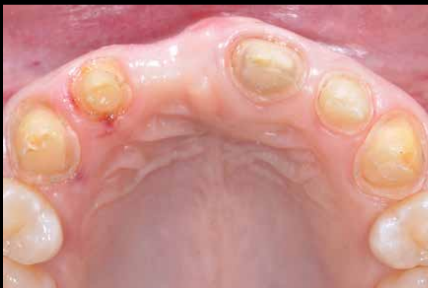
Figure 10: The failing restorations were removed and the severity of the horizontal residual alveolar ridge deficiency at the site of #8 was noted.