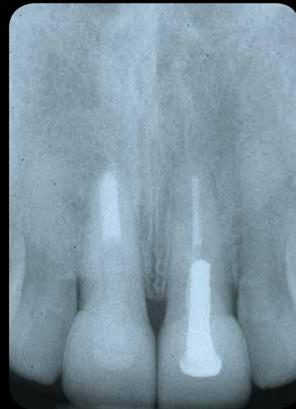
Figure 6: A postoperative radiograph underscores the success of the endodontic therapy and the new fiber post and core on #8, as well as the excellent marginal integrity and the complete excess cement removal.