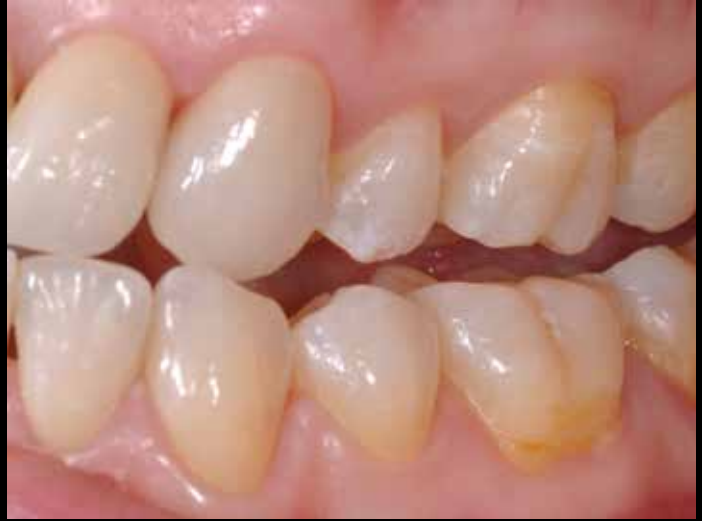
Figures 17a & 17b: The patient was provided with a mutually protected occlusion with canine guidance in lateral excursions and anterior guidance in protrusive movement.