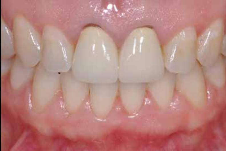
Figure 1a: Preoperative facial view of two failing metal ceramic crowns on #8 and #9. Note the gingival recessions and inadequate margins as well as the opacity of the restorations.

“ In the esthetic zone, the bi-layered approach relies mainly upon the skills of the dental ceramist for a customized ceramic layering and allows the fabrication of highly esthetic restorations. ”