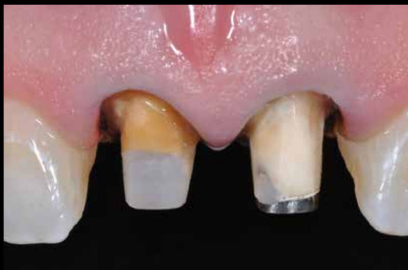
Figure 2b: The cast post and core has been removed from #8 and the endodontic therapy was remade. Subsequently, internal bleaching procedures were performed, followed by the placement of a fiber post and composite-resin core. Due to the complexity of the post removal and the concern about possible complications, it was decided not to remove the cast post and core from #9. The tooth preparations were refined, and a master impression was made.