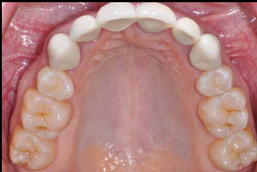
Figure 9: A preoperative occlusal view of the failing metal ceramic restorations. Note the wear on the crowns' palatal aspects as well as the lack of color match with the adjacent dentition.

Acknowledging the advantages and limitations of the different ceramic core materials and harnessing new technologies and restoration design philosophies are key elements for a successful contemporary practice. This visual essay demonstrates how these concepts can be applied to different clinical scenarios, as suggested herein for multiple crowns and FDPs. By following sound concepts of material selection and restoration design, clinicians and ceramists may customize the design of restorations in the esthetic zone based upon each patient's individual needs and, as a result, promote both restoration longevity and esthetics.