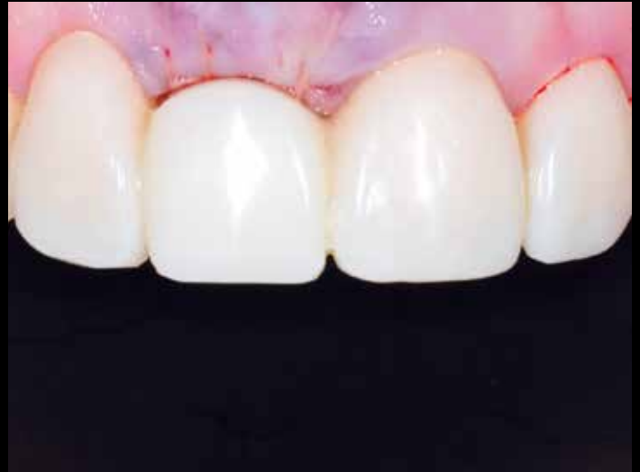
Figure 11b: A provisional restoration was delivered with the pontic shortened at the cervical aspect to eliminate pressure at the augmented site. After three months, once the tissue healed, the pontic site was trimmed with a KS4 extra-coarse football-shaped diamond bur (Brasseler USA; Savannah, GA) and a direct composite resin was added to the cervical part of the pontic to mold the tissue at the pontic site. The tissue was left to heal for an additional three months.