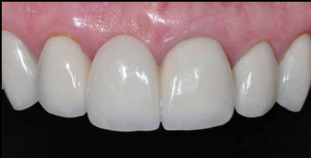
Figure 7: A preoperative facial view of esthetically failing metal ceramic crowns on #6, #10, and #11; and a failing metal ceramic FDP on #7 (retainer), #8 (pontic), and #9 (retainer). Note the opacity of the restorations, which were made and remade a few times previously.