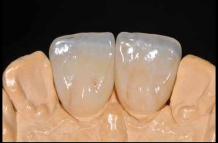
Figure 3b: A monolithic approach was used for the design and fabrication of the functional palatal aspects of the crowns to ensure that the palatal anatomy of the restorations coincided with the patient's envelope of parafunction. This was reproduced using the provisional restorations and to ensure optimization of the mechanical properties of the occlusal contacting areas of the restorations. The facial and incisal aspects of the crowns were conventionally layered to facilitate internal characterization, translucency, and esthetics using nano-fluorapatite-layering ceramics (IPS e.max Ceram).