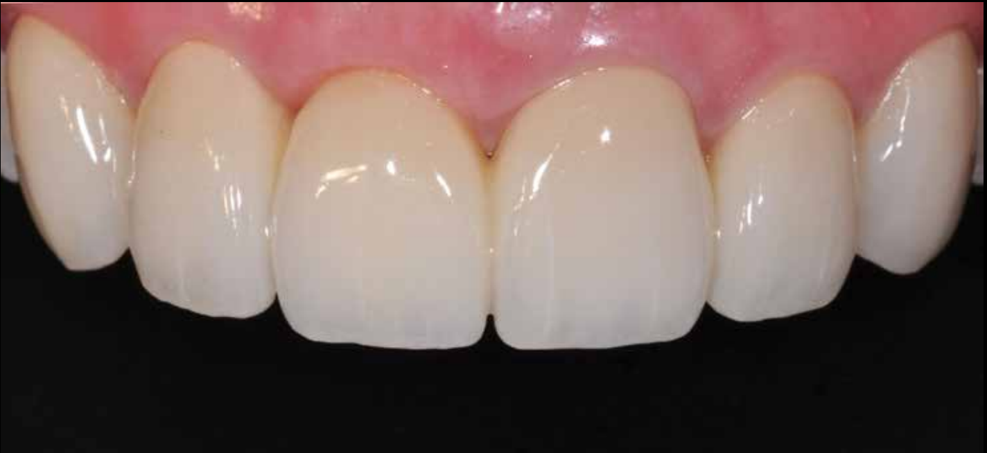
Figure 18: The ceramist layered the facial and incisal aspects of the restorations so as to provide characterizations and translucency to the patient's satisfaction.