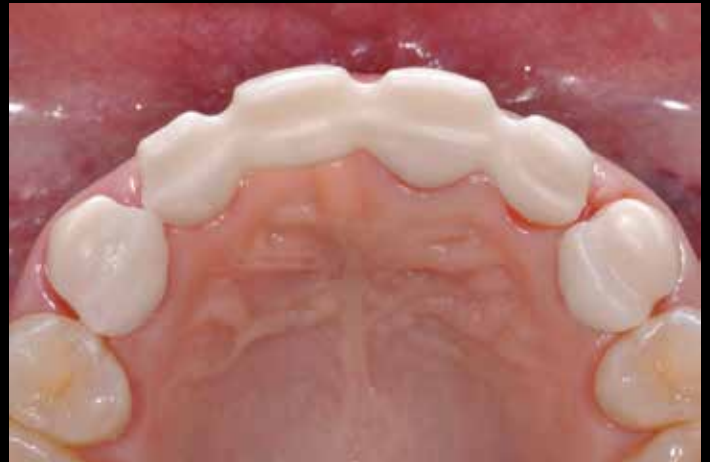
Figure 13: A zirconium dioxide framework with extensive palatal and interproximal struts was designed and milled with a CAD/CAM system (Lava, 3M ESPE). The framework and copings were tried in the patient's mouth for fit and for soft tissue evaluation at the pontic site. A monolithic approach was used for the design and fabrication of the restorations' palatal aspects.