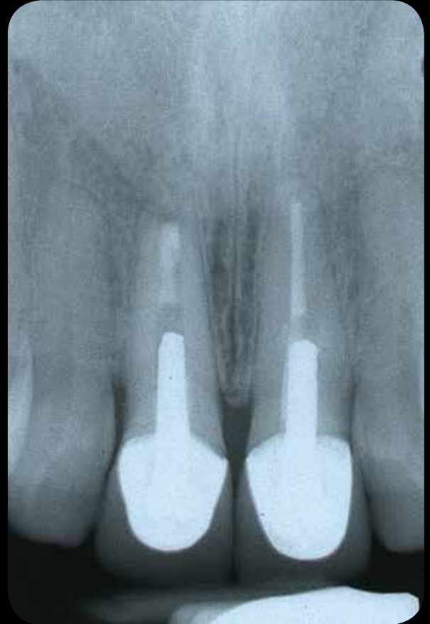
Figure 1c: Although #8 and #9 were asymptomatic, a preoperative radiograph indicates a failing endodontic treatment and less-than-adequate marginal integrity on the crown of #8.