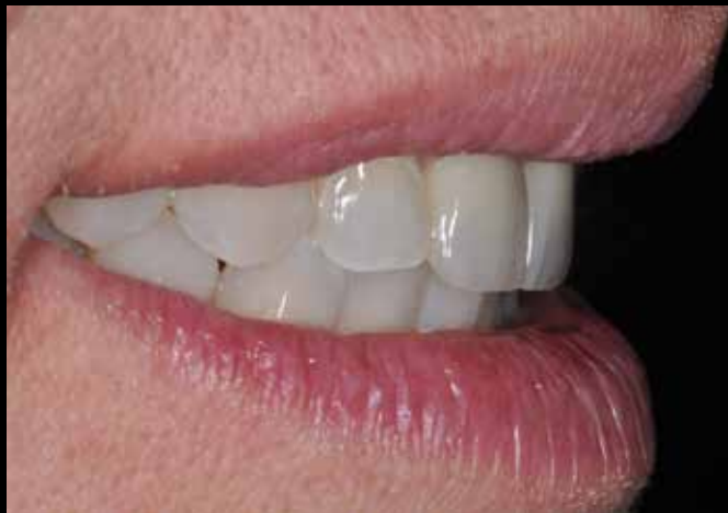
Figures 5b & 5c: Right and left lateral views of the patient's partial smile demonstrate the successful integration of the restorations with the upper and lower lips.