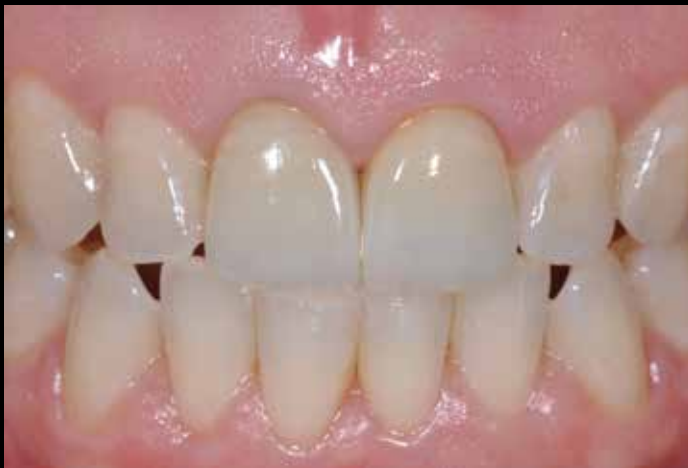
Figure 4a: The restorations were tried in the patient's mouth to assess color match and esthetics and internal and proximal fit, and to assess occlusal contacts. Functional, esthetic integration with the adjacent and opposing dentition, as well as integration at restorative soft-tissue interface, was noted.