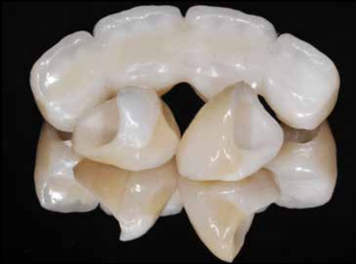
Figure 14: The zirconium dioxide framework was conventionally layered with a corresponding veneering porcelain (Creation ZI-F, Jensen Dental; North Haven, CT). The zirconium dioxide-based crowns were layered using a digital veneering approach (Lava DVS digital veneering system).