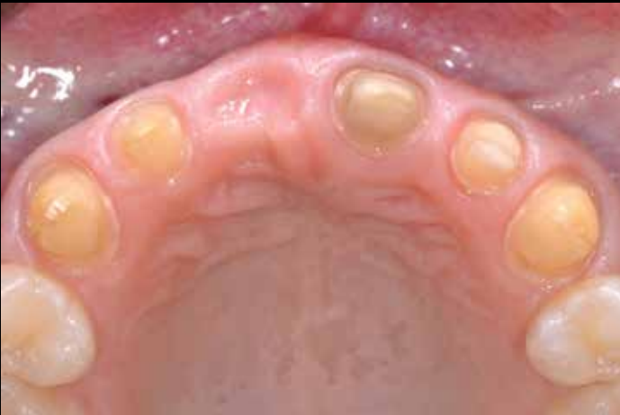
Figure 12: Once the pontic site was completely healed, the tooth preparations were refined and a master impression was made for a zirconium dioxide-based, four-unit FDP for #7 (retainer), #8 (pontic), and #9 (retainer); and zirconium dioxide-based crowns on #6 and #11.