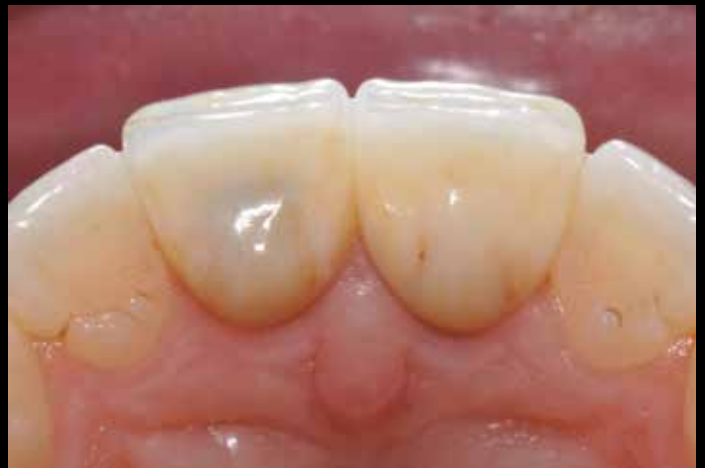
Figure 4b: Once verified, the restorations were bonded with dual-cured translucent composite-resin cement (RelyX Ultimate, 3M ESPE; St. Paul, MN). However, it was also noted on the palatal aspect of the crown on #8 that the discolored tooth projected a low value through the restoration due to the translucency of the restorative material.