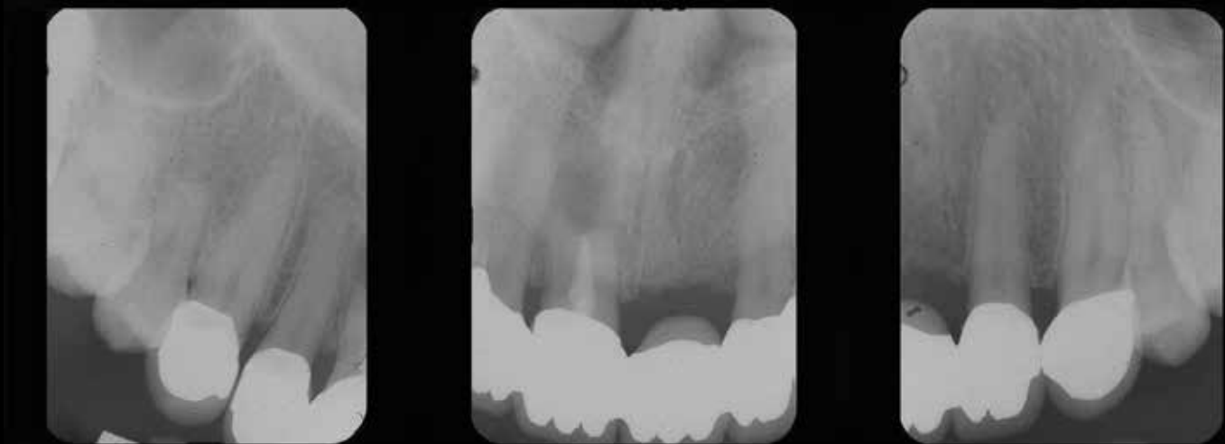
Figure 16: Excellent marginal integrity and excess cement removal were confirmed.