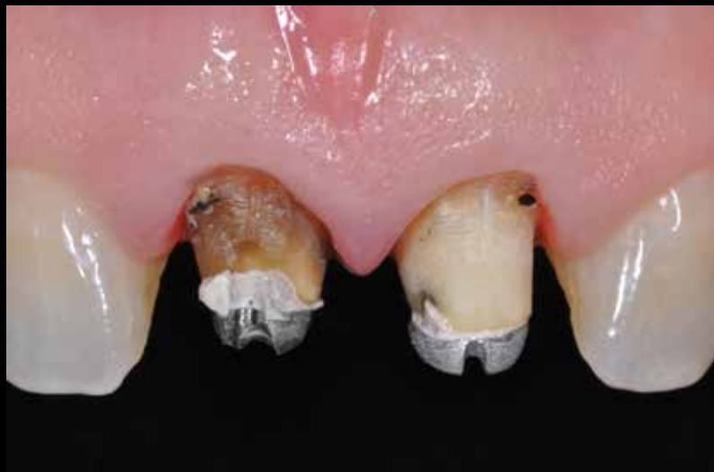
Figure 2a: The failing restorations were removed, and the severity of the discoloration was noted for #8. The lack of adequate fit of the cast post and core for both teeth was determined as well.

With excellent biocompatibility, zirconium dioxide may be designed and processed via CAD/CAM technology. 7 Superior to lithium disilicate in terms of mechanical properties, zirconium dioxide currently allows for the fabrication of less translucent restorations for both crowns and FDPs. 10,11 However, new zirconium dioxide materials are being developed with improved optical and mechanical properties. In addition, the wear properties of zirconium dioxide are improving as related to the opposing dentition. 12,13 With zirconium dioxide, restorations might be fabricated using the monolithic, bi-layered, or hybrid design approach. The latter two include