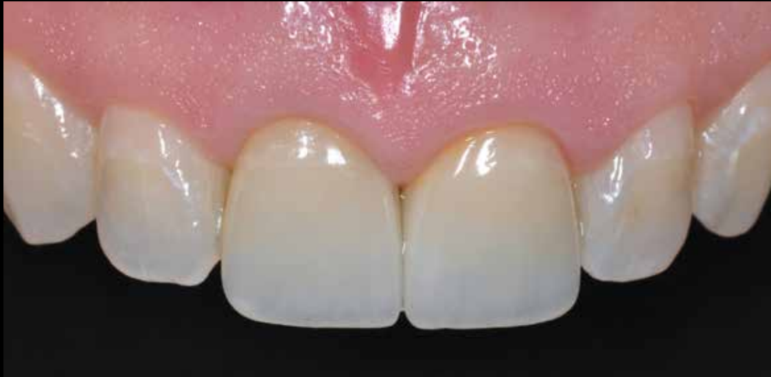
Figure 5a: A frontal view demonstrates both high translucency at the incisal areas and characterizations at the facial aspect of the restorations; this was the result of the artistic capabilities of the dental ceramist who layered the restorations' facial and incisal aspects.