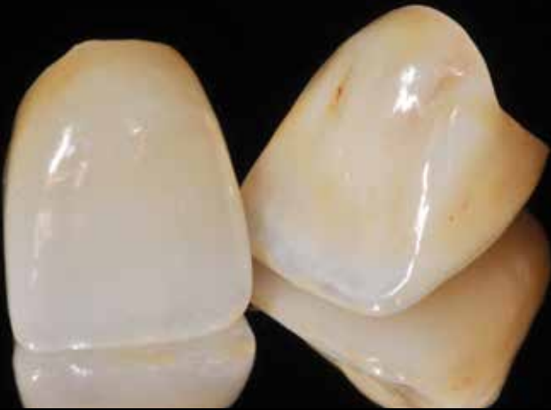
Figure 3a: Lithium disilicate ceramic material was selected for the fabrication of definitive all-ceramic crowns on #8 and #9. Medium-opacity lithium disilicate ingots (MO1, IPS e.max Press, Ivoclar Vivadent; Amherst, NY) were selected for the fabrication of partial monolithic all-ceramic crowns.