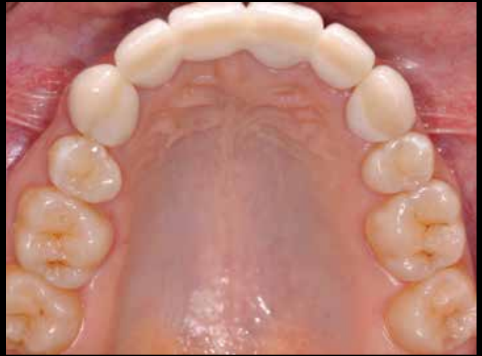
Figure 15: The restorations were conventionally cemented with self-etching, self-adhesive, dual-cured composite resin cement (RelyX Unicem 2).