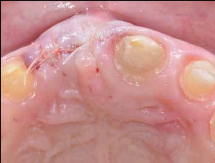
Figure 11a: Soft tissue augmentation of the residual alveolar ridge was performed using acellular dermal matrix (Alloderm RTM, Lifecell, Biohorizons; Birmingham, AL) to eliminate the horizontal ridge deficiency at the pontic site.