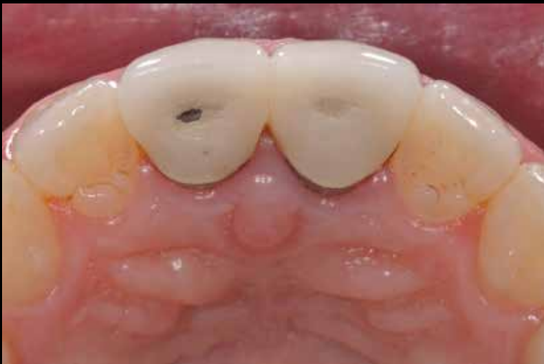
Figure 1b: Preoperative occlusal view of the two failing metal ceramic crowns. Note the wear patterns on the palatal aspects of the crowns.