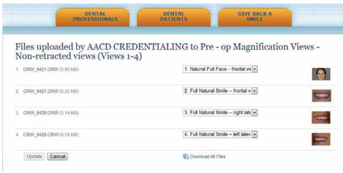
Figure 3: Example of case images uploaded to the module, with file names and descriptions.

When a user hovers over the Written Examination, Clinical Case Submission, or Oral Examination categories with the mouse, they will see an explanation of each requirement and how the requirement must be fulfilled. For instance, the case submission category provides detailed information about how a user must submit case materials and what photo formats are required. When users click on the case types, they are provided with a printable guide explaining how the case will be judged by Accreditation Examiners.