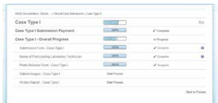
Figure 2: Example of a Case Type I progress check, indicating completed steps and those yet to be completed .

The module is available to AACD member dentists and laboratory technicians who are in the process of Accreditation, and it is also available to non-AACD members. AACD members log into the module through My AACD, the AACD's online member community.