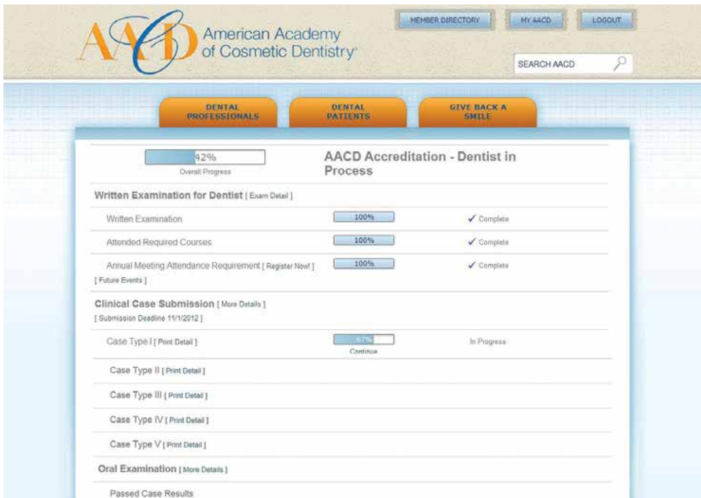
Figure 1: Dashboard of module upon login for a dentist in the process of Accreditation.