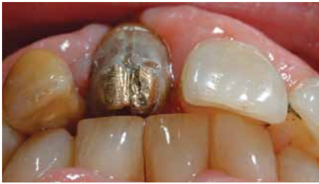
Figure 5b: Incisal view of teeth in occlusion. The gold post is touching the opposing incisor with no clearance for the final restoration.