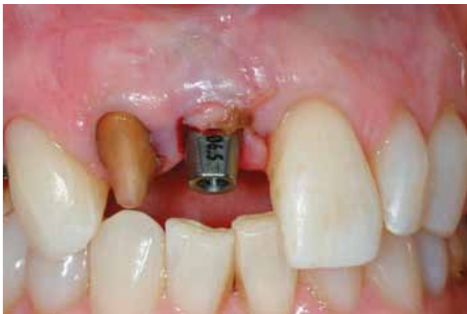
Figure 18a: Implant conservatively uncovered and stock abutment placed to support a provisional restoration.