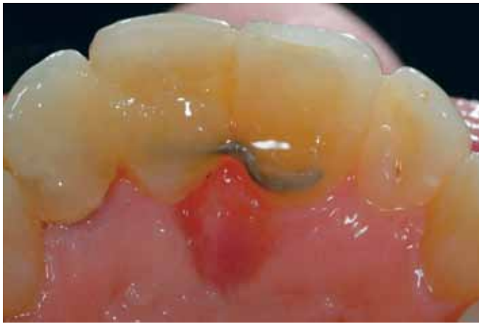
Figure 11: Lingual wire bonded to the adjacent central incisor to prevent rotation on the provisional.