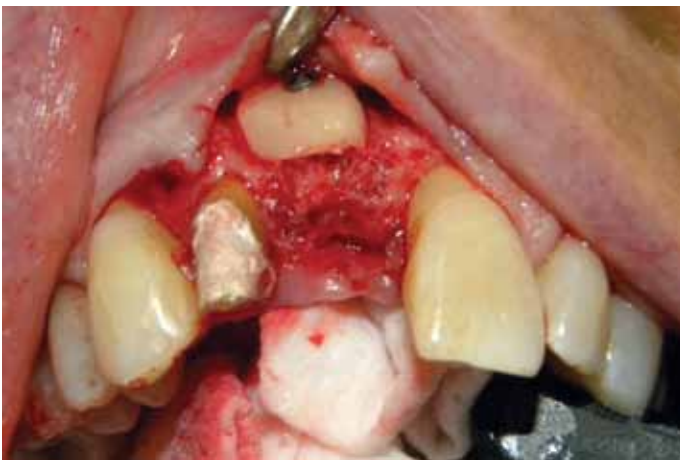
Figure 13: Bone graft in place, screw-retained for increased stability.