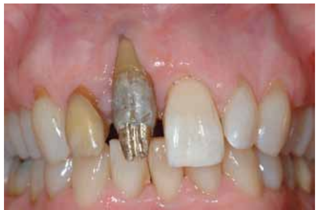
Figure 5a: Labial view of the right central incisor without the PFM crown.