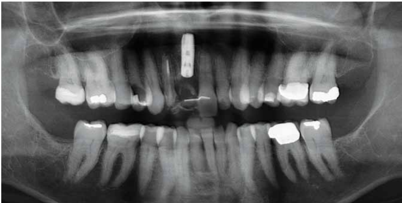
Figure 17: Periapical radiograph showing implant in position.