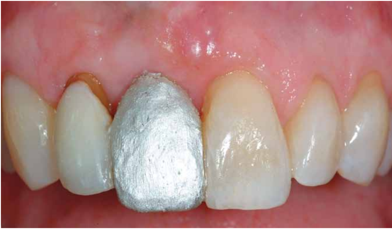
Figure 15: Colloidal silver painted over existing provisional to highlight tooth contours on the CT image.

After four months of healing, colloidal silver was painted on the provisional to have as a radiopaque reference of the outer contours of the provisional in relation to the available buccal-palatal bone. A computerized tomogram (CT) was taken to generate a digitally-planned surgery (Fig 15).