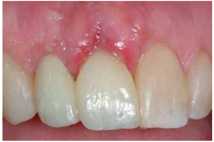
Figure 10: The #8 pontic using a subgingivally under-contoured provisional restoration splinted and cantilevered to the lateral incisor and bonded to the adjacent central incisor.