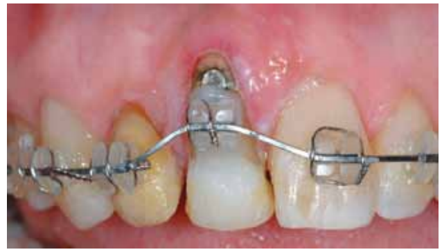
Figure 6: As the tooth is erupted, a narrower part of the root is brought coronally and diastemas appear.

After proper healing of the bone graft and allowing the soft tissue to mature (Fig 14), implant planning was done with the advantage of computerized tomography. Not only was the intent to plan for the best implant position in relation to an esthetic outcome, but also to measure the bone density after all implemented treatment modalities.