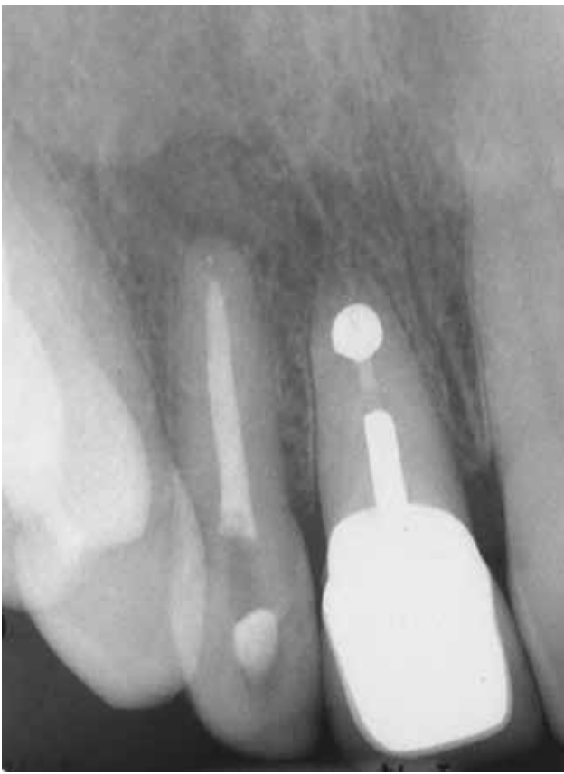
Figure 2: Periapical of #7 and #8.