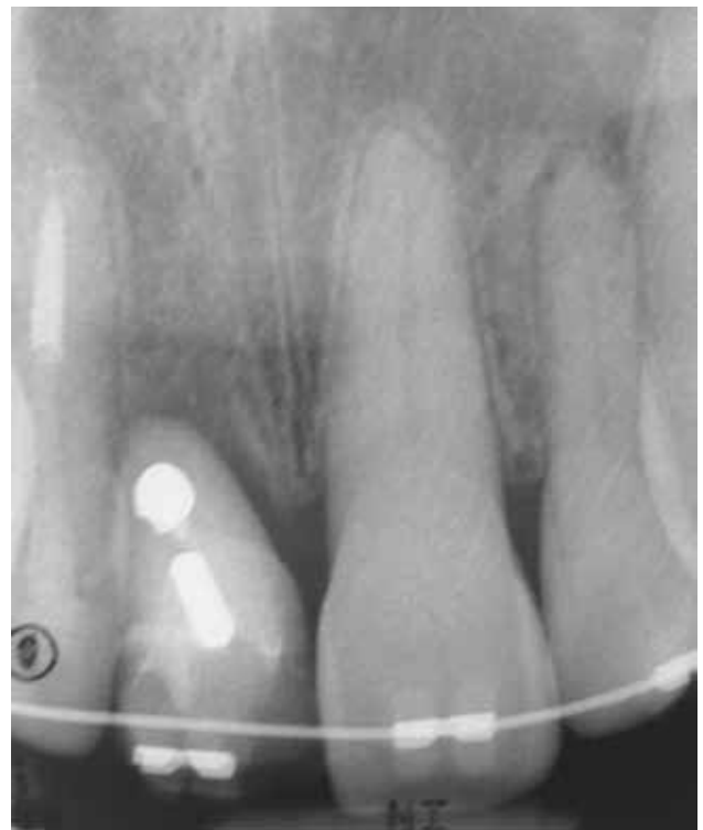
Figure 8: Radiograph after five weeks of orthodontic treatment.