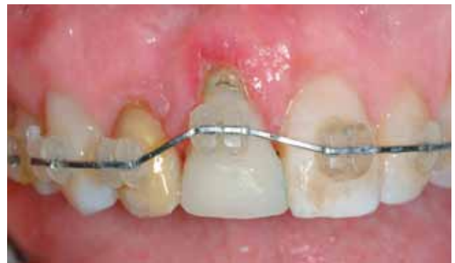
Figure 7: Modification of existing provisional to maintain original mesio-distal tooth width and form. Gingival tissues are rapidly adapting to the new tooth position.