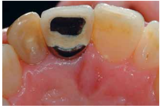
Figure 4: There was a history of aggressive occlusal adjustment on the #8 crown.