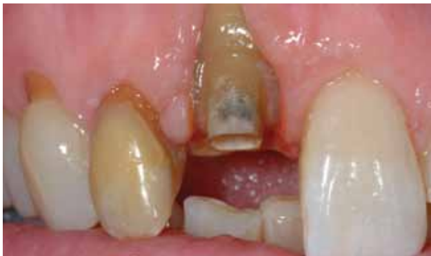
Figure 5c: Adequate incisal clearance must be created for the orthodontic eruption of the root to be accomplished in the absence of occlusal trauma.