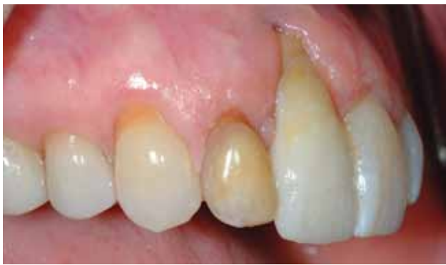
Figure 5e: Provisional restoration permanently cemented.

and soft tissue augmentation 1,2 with subsequent corrective procedures often required. A patient with a recent five-year history of bisphosphonate therapy would need to be cautioned about such an aggressive approach if a suitable option presented itself. A possible alternative, adjunctive orthodontic eruption, is often considered when the hopeless tooth in question retains a relatively intact apical fiber apparatus capable of influencing the surrounding tissue. This orthodontic therapeutic modality is well documented and has been utilized effectively to help correct restorative, periodontal as well as esthetic clinical challenges. 3-9