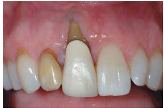
Figure 3: Advanced gum recession of 9 mm with loss of the labial bone. No attached gingivae, with the surrounding tissue extremely inflamed and exhibiting bleeding upon probing.

To accomplish this goal, reconstruction of the lost bone and soft tissue in the area of the right central incisor is a primary consideration. Myriad surgical techniques are available today that are capable of accomplishing this. To correct such an extensive defect, however, all surgical protocols would require a staged approach of multiple procedures involving both bone