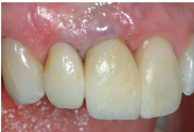
Figure 18b: Lateral and central incisors with provisional restorations.

extrusion” may be a viable modality to recreate lost hard and soft tissue profiles. This is especially true for patients that may require a cautious surgical approach. Therefore, we must revise our treatment design and make the necessary adjustments during therapy based on the implemented techniques, anticipated results, and host response. Mid-course evaluation can be critical and extremely helpful, even if a change of treatment modalities or sequencing is required. In the case discussed here, multiple treatment modalities—orthodontic, surgical, digital, and restorative—were utilized to regain balance, harmony, and continuity of form in a challenging esthetic environment.