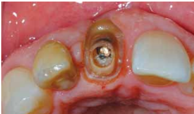
Figure 5d: Incisal view of the canal preparation, creating enough internal retention to prevent dislodgment of the provisional.