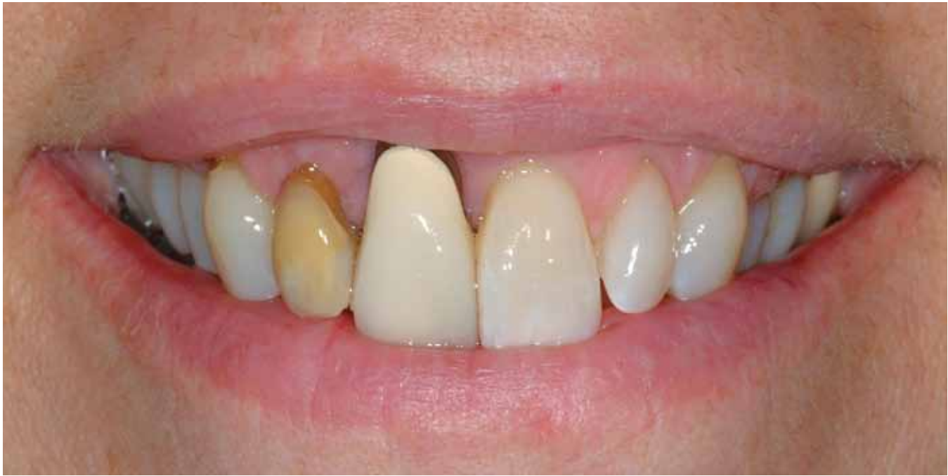
Figure 1: Image displaying the patient's high lip line. She also was unhappy with the cosmetic deformity related to her right central incisor.