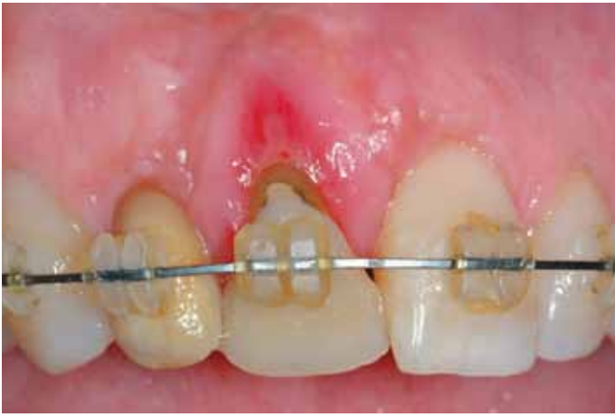
Figure 9: New orthodontic treatment completed in five weeks to meet the original objective of improving soft tissues and balancing gingival levels.